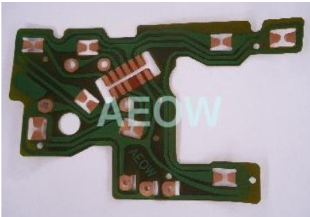
Printed Circuit "B" 3 Cluster 73 on Mini

KVW023 $75.00 SB468 $180.00 CSE25D4 $20.00 CTE25D4 $20.00 CTE45D4 $20.00 CSE45D4 $20.00 SPC04 $15.00 LENS01 $80.00 L632 $150.00 37H7512 $30.00 AAU5510 $70.00 FP12V $60.00 37H4881 $70.00